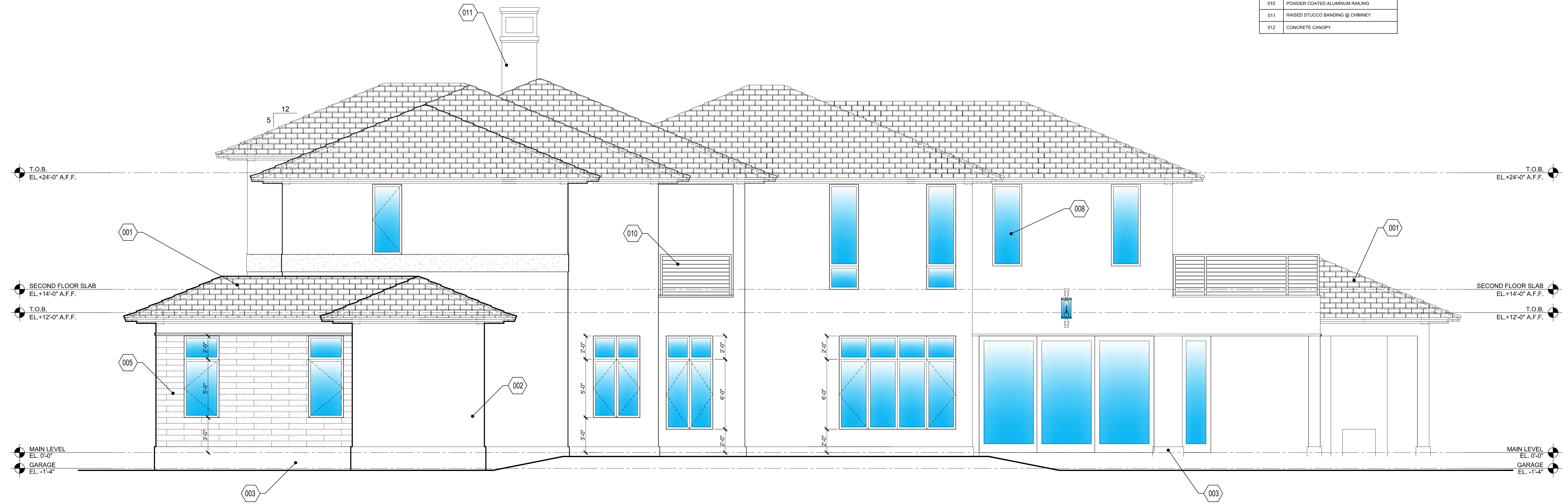
2 RIGHT ELEVATION 1/4"=1'-0"